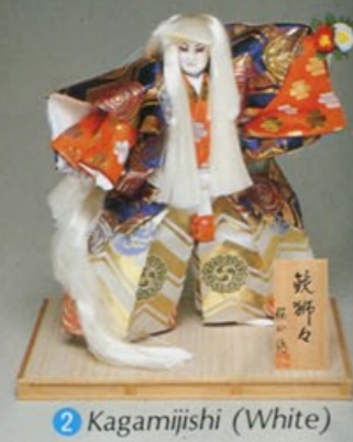
2 Kagamiijishi (White)