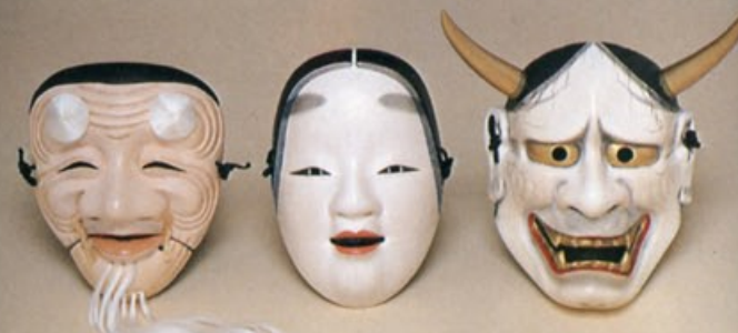
83 84 85