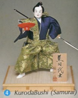
4 KurodaBushi (Samurai)