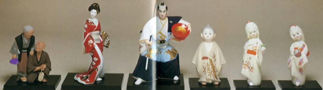
48 Arigatosan 49 Harunoume 50 Kurodabushi 51 Takedoushin 52 Uguisu 53 Temari