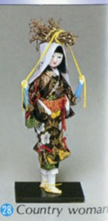
28 Country woman