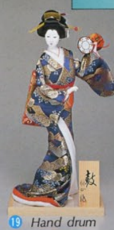
19 Hand drum