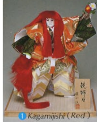
1 Kagamiijishi (Red)