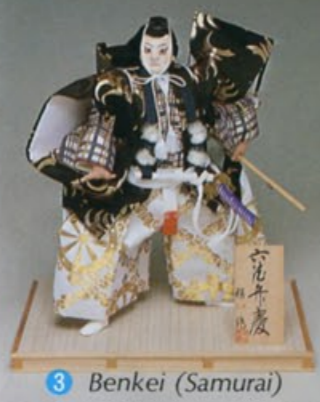
3 Benkei (Samurai)